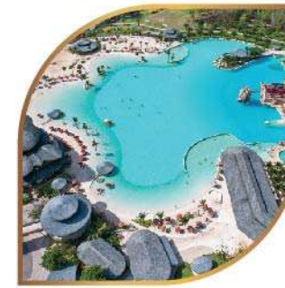
Blue Tree Water Park 2.5 Kilometers