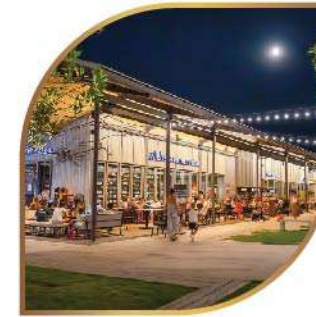
Porto De Phuket Department Store 3.9 Kilometers