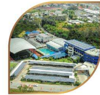
Head Start International School 3.2 Kilometers