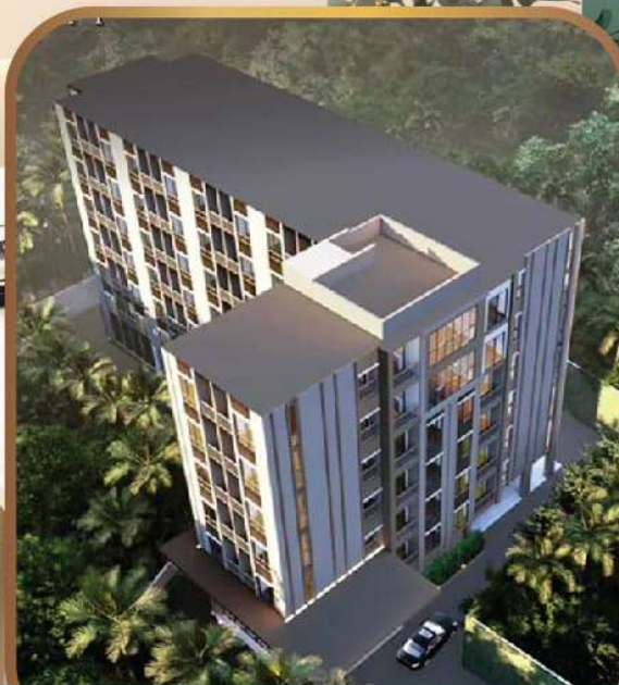
THE CUST CONDO

PCR Construction Co., Ltd. invests in top-tier teams and cutting-edge equipment, reflecting the dedication to quality. Key services include turnkey project service, design and planning, construction, and project management.