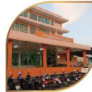
Thalang Hospital 4.1 Kilometers