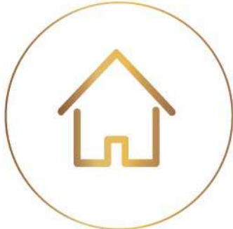
6 EXCLUSIVE POOL VILLAS