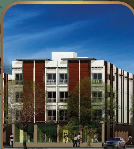
BARAMÉE COMMERCIAL PATONG