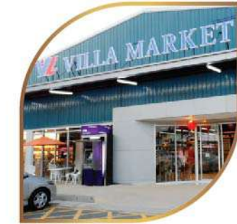
Villa Market 4.1 Kilometers