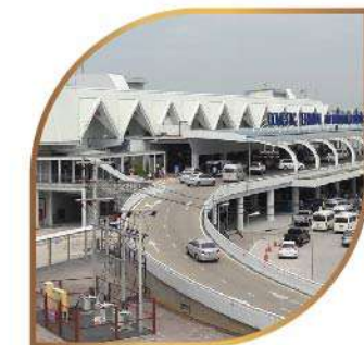
Phuket International Airport 18.5 Kilometers