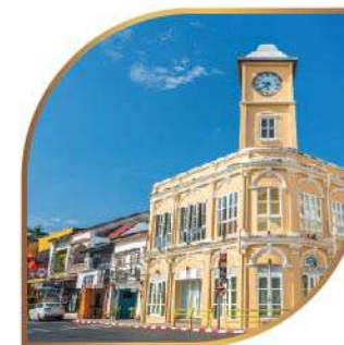
Phuket Town 18.2 Kilometers