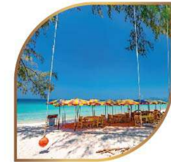
Bangtao Beach 6.3 Kilometers